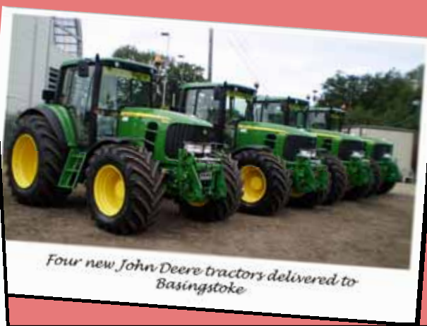
Four new John Deere tractors delivered to Basingstoke

Basingstoke recently took delivery of 4 new John Deere tractors. These new arrivals, sporting the McKeefry logo just like other company vehicles, will be used for working in various contracts in and around the Basingstoke and Crawley area taking sludge to land.