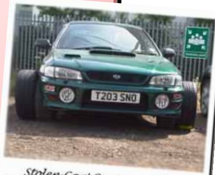
Stolen Car! Contact Carlos Fandango with any information

Fellow employees hope that the new double wheels and tyres set up will help stop him from hitting unsuspecting animals!