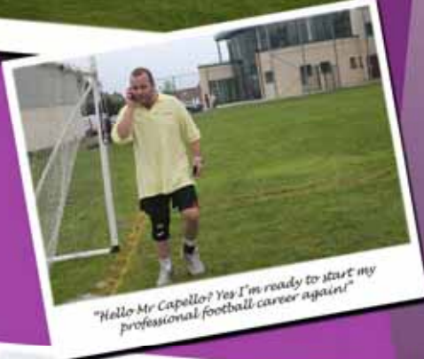
"Hello Mr Capello? Yes I'm ready to start my professional football career again!"